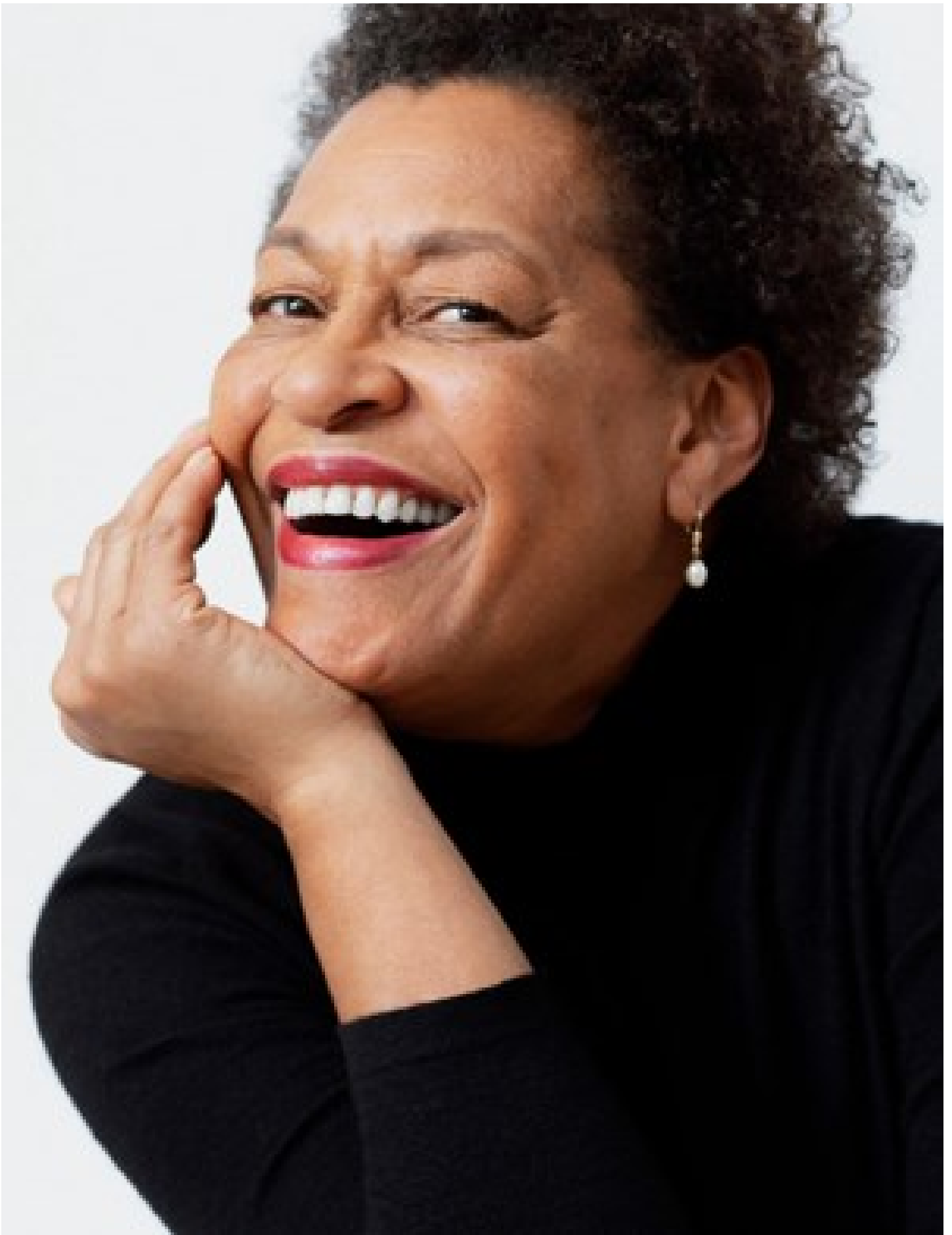
Carrie Mae Weems

“The four new mentors who join the initiative’s community of creative greats have broken new ground in their respective fields and we look forward to the impact they will have on their protégés, as they pass on their devotion to their art in this cross-generational exchange.”