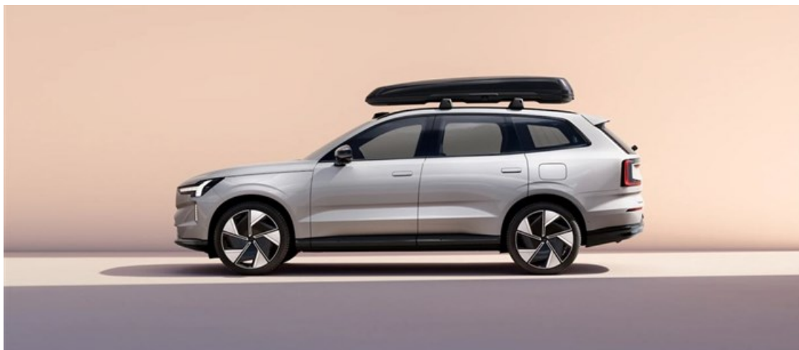
The upcoming Volvo EX90 will be a software defined vehicle.

The decision to include lidar technology in their vehicles is driven by a commitment to safety. Lidar, Rowan explained, is currently the only technology capable of detecting objects up to 250m away in pitch darkness. This capability is particularly important given that many serious accidents occur at night when visibility is reduced.