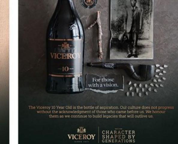
Not for Persons Under the Age of 18.