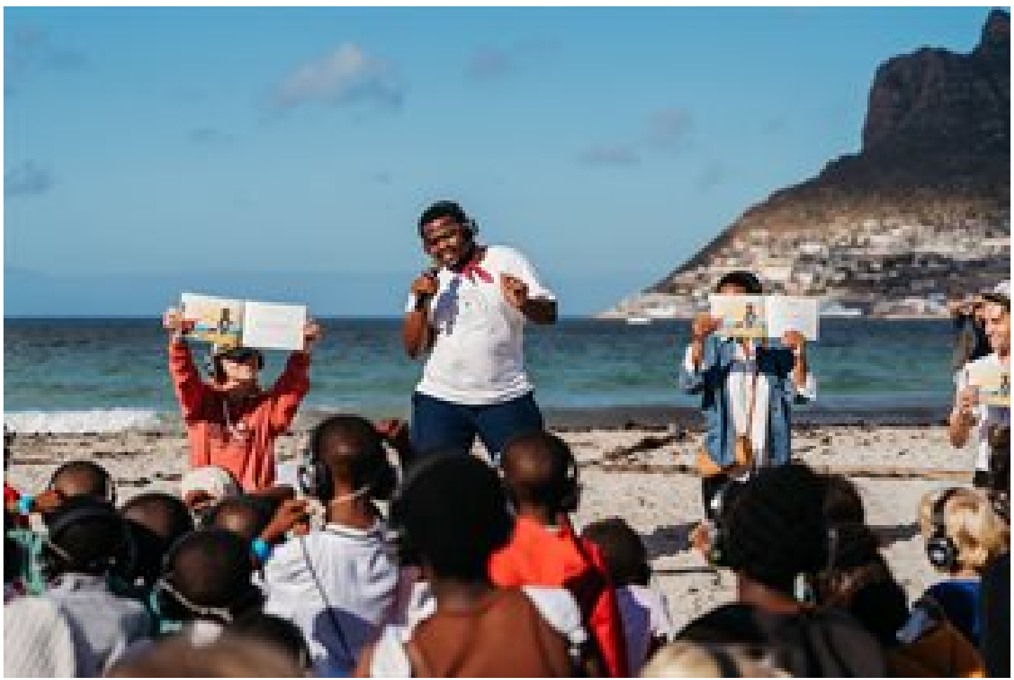
The Fanplastic Dance took place on 2 March 2024 at Hout Bay Beach, kicking off with a captivating storytelling from Captain Fanplastic, then City of Cape Town's Bingo the bin offered a lesson to remember. After an energising dance