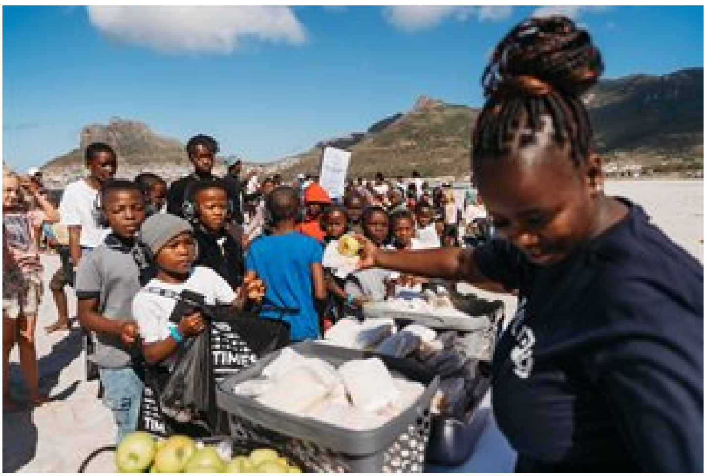
"We believe in the power of collective action and collaboration to ensure that governments, NGOs, and private sector partners can work together towards achieving sustainable development and reaching the 2030 agenda. This, in projects like