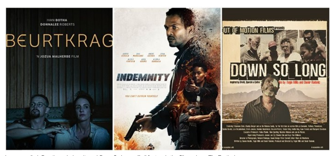
Image supplied: Beurtkrag, Indemnity and Down So Long will all feature in the SilwerskermFilmFestival

All the events on the hybrid festival's main programme will take place simultaneously at the Bay Hotel in Camps Bay and the Silwerskerm Film Festival website from 23 March to 26 March 2022, movie lovers from across the country can now sign up to enjoy the festival from the comfort of their homes. The registration fee for the virtual festival and four days of premium local movie entertainment is R190 and will be donated to the Tribuo Fund, which was created to assist entertainers suffering a loss of income due to the Covid-19 pandemic. To register for the virtual festival, go to the Silwerskerm Film Festival website.