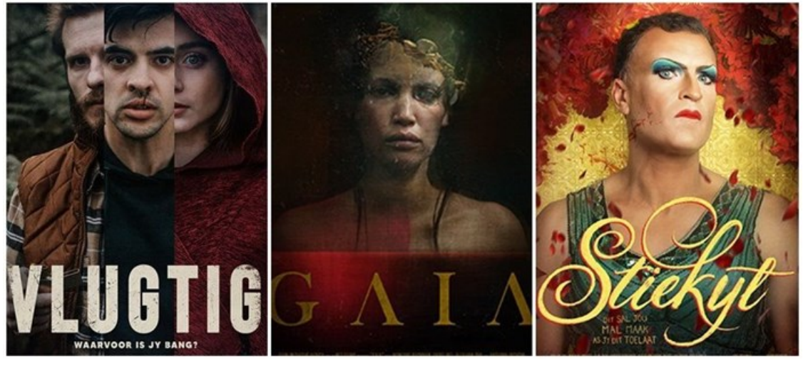
Image supplied: Vlugtig, Gaia and Stiekyt will all feature in the Silwerskerm Film Festival

The highly anticipated 10th-anniversary Silwerskerm Film Festival will play out in a brand-new hybrid format from 23 March 2022 when it showcases South African filmmaking at its best.