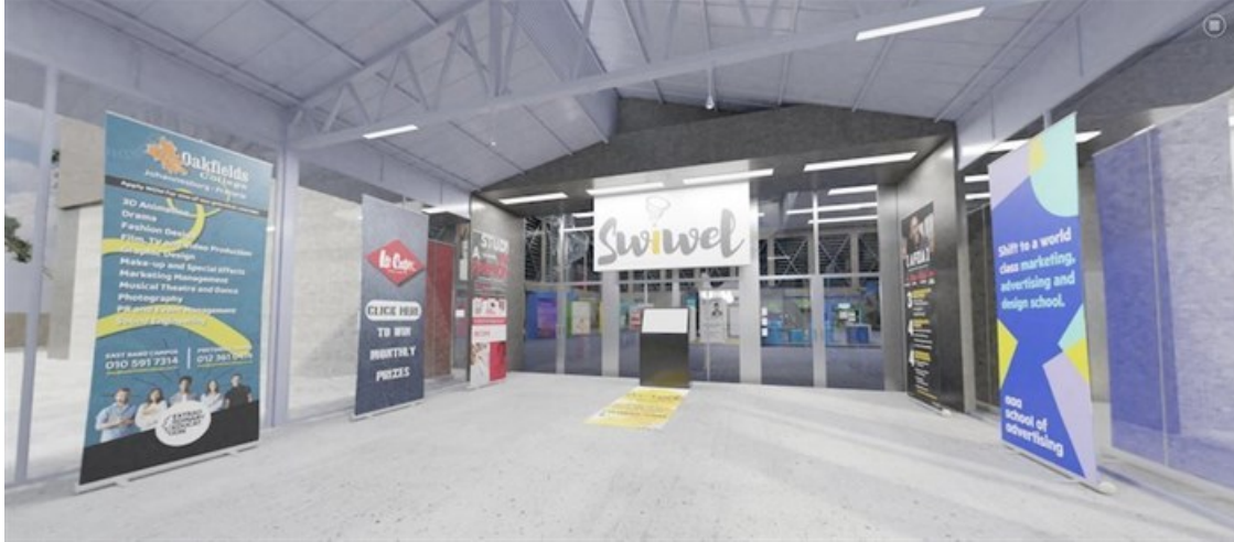
Image: Enter the Swiwel 3D career expo

Today, over half a million matriculants are learning that they have passed their final exams and are potentially eligible to apply for higher education. With many of those not even considering the possibility until now, where do they start looking? Enter Swiwel...