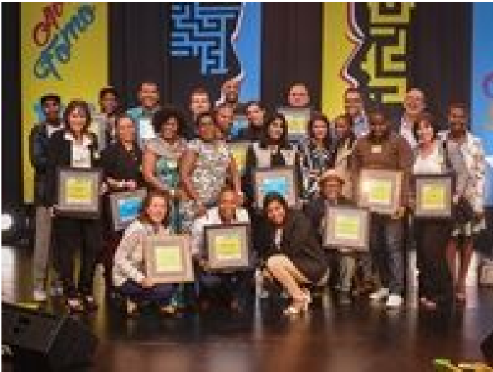
The annual event was held at the Sandton Convention Centre this year to accommodate the enormously growing platform that the awards have become for marketers, brands and celebrities alike.

For more, visit: https://www.bizcommunity.com