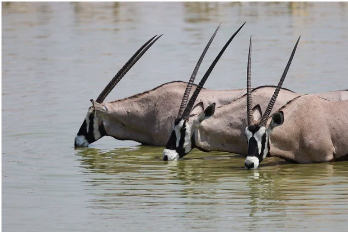
More than just humans rely on the pristine drinking water from our aquifers

If disaster strikes, the repercussions will be widespread. Yes, our drinking water would be jeopardised but many more areas would also feel the impact: