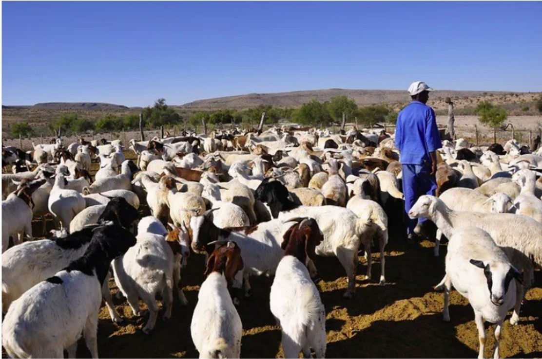
Sauma: protecting life and hope in the heart of the Kalahari

In an era where conservation challenges loom large, V5 Digital has taken a significant step in empowering environmental stewardship. Long-time members of the Pledge 1% initiative, our team used their expertise to create an impactful online presence for the Stampriet Aquifer Uranium Mining Association (Sauma) , a beacon of water protection advocacy in Namibia.