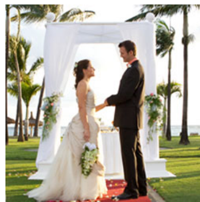
Sugar Beach for your day to remember?