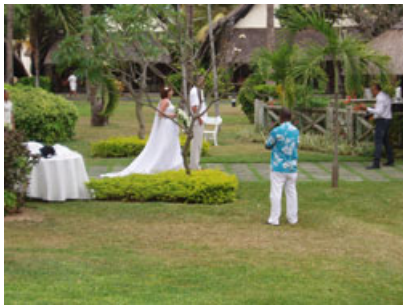
Your wedding can be simple and just for the two of you, plus a witness or two and – of course – the officiating officer. This wedding took place at La Pirogue.

Mauritius is a prime wedding and honeymoon destination for couples from South African, but also the UK, Europe, India, increasingly Bangladesh, and other parts of the world.