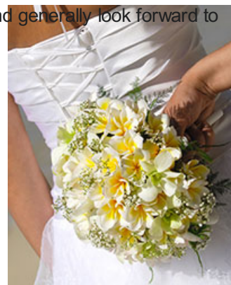
Sometimes it's well worth uttering the longest sentence...