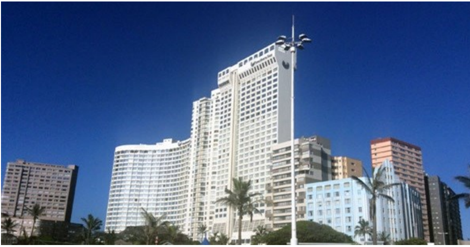
The majestic Elangeni-Maharani, shot during my brief stay in Durban with the Loeries team a few weeks ago

The Tsogo Sun Elangeni-Maharani will be the focal point on the beachfront, in walking distance for Loeries Creative Week™ Durban and for the fringe events - which got Loeries town hall meeting attendees to perk up and pay attention, as the fringe is where the community can create pop-up events of an entertaining, creative nature like the craft and food market set to make its first appearance this year.