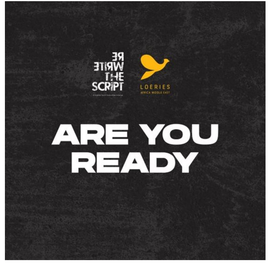
The \ensuremath{\textit{Rewrite the Script}} 2022 LYCs campaign has launched on Instagram

The Rewrite the Script campaign by the 2022 Loeries Youth Committee (LYC) has launched on Instagram.