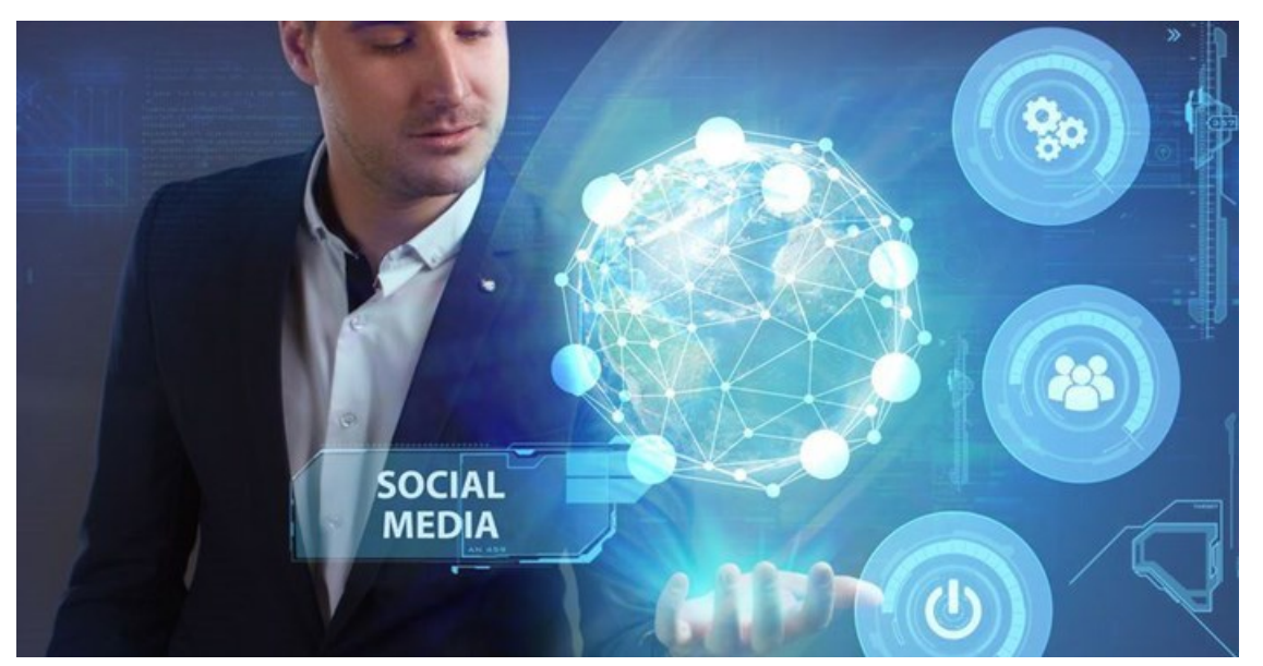
The SA Social Media Industry Report 2023 shows a strong correlation in South Africa between access to social media and privilege.

Launched today on World Social Media Day, the The SA Social Media Industry Report 2023 shows a strong correlation in South Africa between access to social media and privilege.