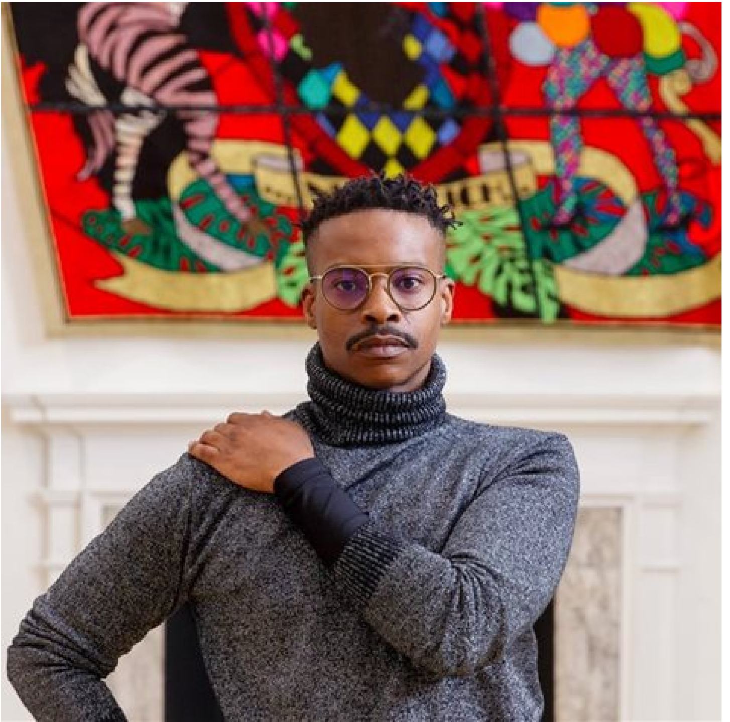
Pictured: acclaimed South African artist Athi-Patra Ruga collaborates with Zeitz Mocaa