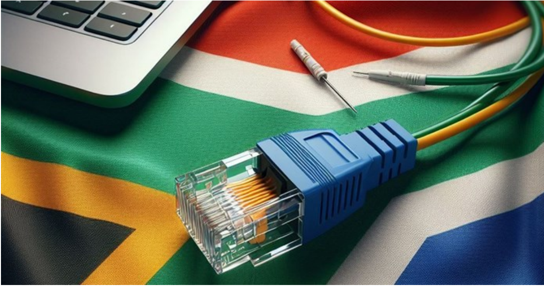
A tough day at the office for internet users in South Africa

Some chaos hit South Africa at lunchtime today as Microsoft battles a service outage across the Europe, Middle East, and Africa (EMEA) region that has left businesses and private users high and dry without access to cloud services like Microsoft 365, Teams, and Azure.