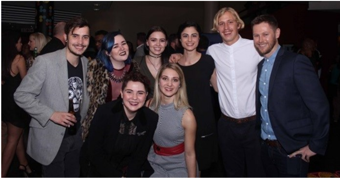
Loeries 2016-winning Vega students.

This year, Vega students took home seven student Loeries in total. As a result of Gen V's success – they're the ones who don't do conformity and don't do ordinary, remember – the Vega School of Branding was ranked third in the Loeries' 'top educational institutions for 2016' table.