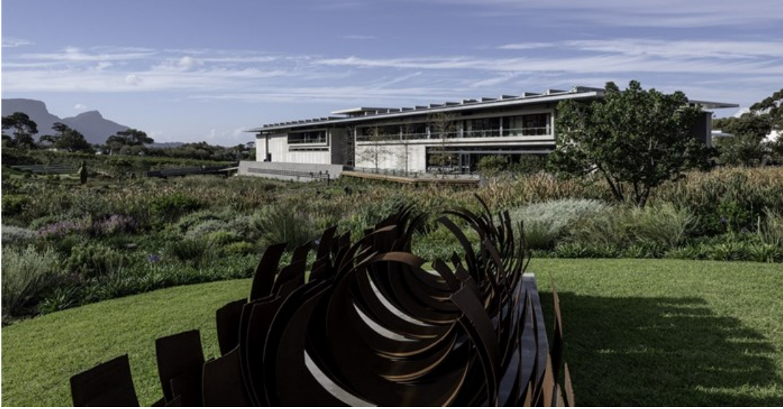
Norval Foundation sculpture garden

Cape Town boasts many iconic experiences, but it is fast becoming the world's newest art hot spot. Now there are new experiences for art aficionados - beyond the Museum of Modern Art in New York, the Tate Modern in London or the Louvre in Paris - as Cape Town finds its feet among the art capitals of the world, with artwork transcending the traditional craftwork mostly associated with Africa.