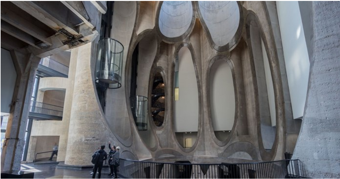
Zeitz MCAA, The Atrium

The Norval Foundation building, which showcases one of the largest private art collections in South Africa, was designed to take account of the sensitive wetland bordering the ground it sits on. An integral part of the construction project was to create a sculpture garden between the building and the wetland, which is home to a colony of endangered Western Leopard Toads. The entire project serves as an example of the successful integration of construction development and the rehabilitation of damaged environmental spaces.