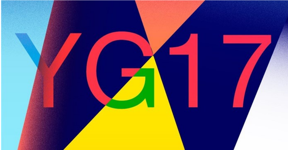
YG17 logo.

Hailing from 22 countries around the world, 81 creative professionals have been named as finalists in the Young Guns 17 competition. Run by The One Club for Creativity, the competition aims to acknowledge international creative professionals aged 30 or younger.