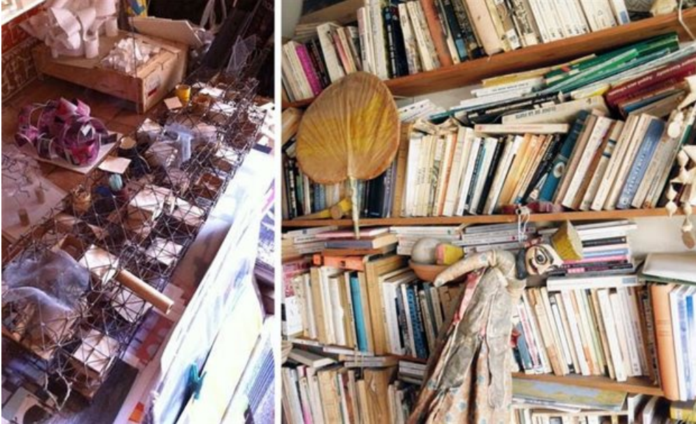
Yona Friedman's model of the Spatial City, on the left, and his library, on the right, at his apartment at Boulevard Garibaldi in Paris, March 2012.

Architecture has lost a great visionary. Budapest-born French architect Yona Friedman died at age 96 on 20 February.