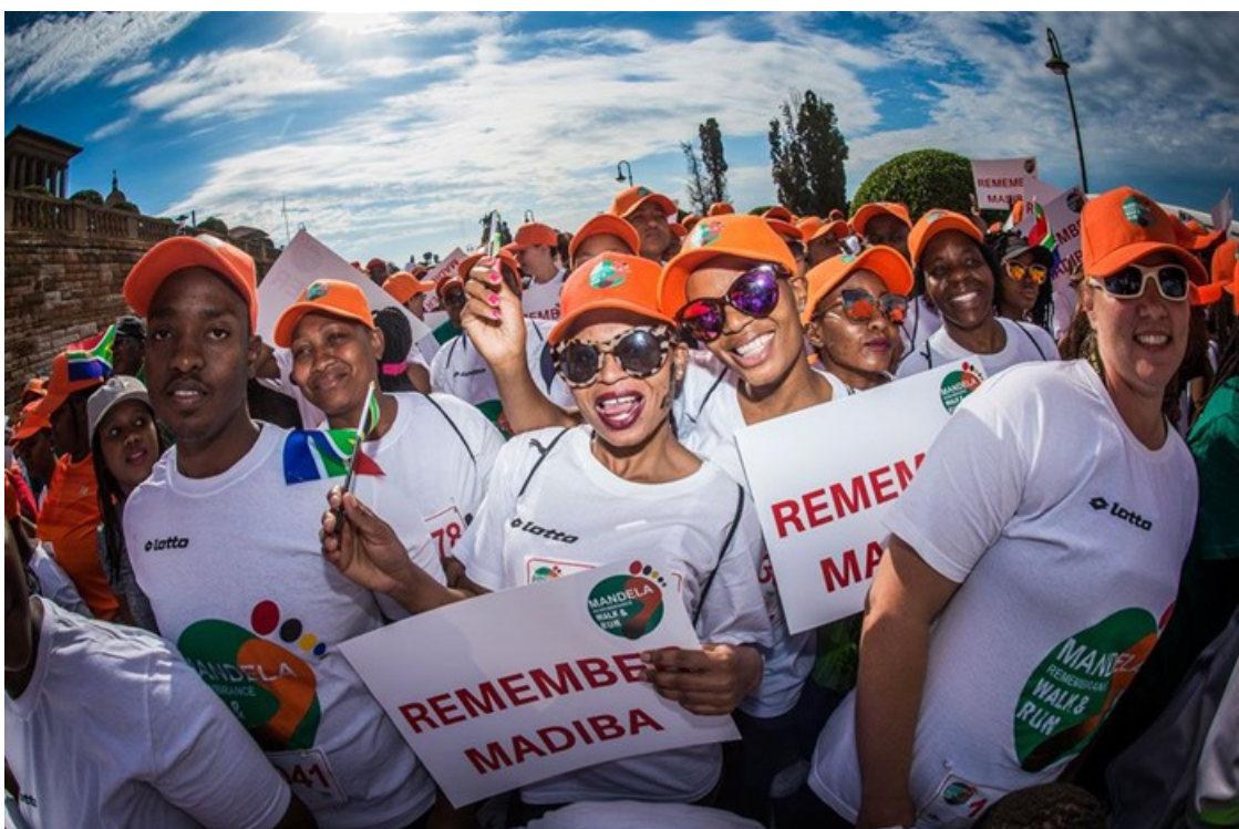
Participants of last year's event celebrating Mandela's life and legacy.