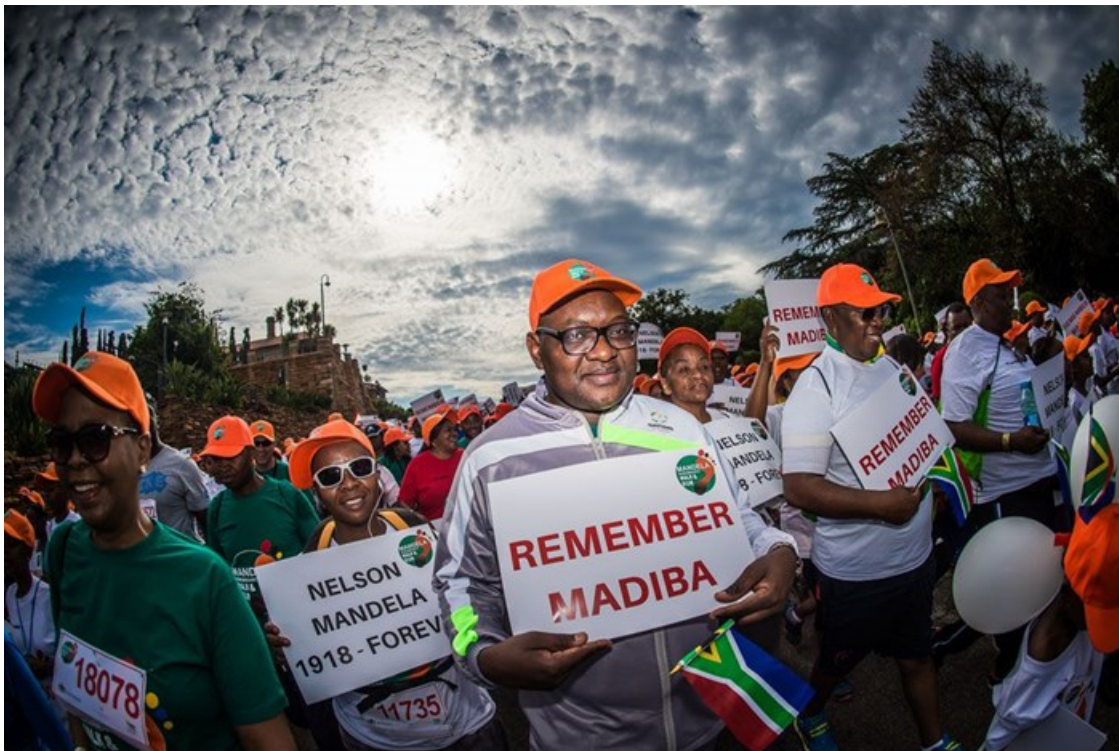
Hon. Premier David Makhura at MandelaRWR 2017 5km walk.