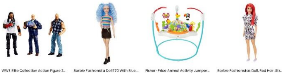
Fraudulent page selling Barbie dolls.

One of the fraudulent pages discovered lures users with special offers on Barbie dolls coinciding with the movie launch.