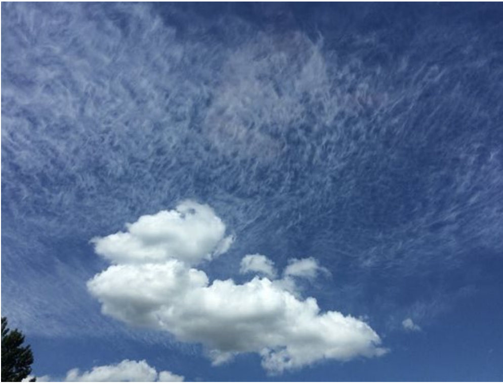
Cloud feedback properties depend in part on the type and altitude of the cloud. (Alex Crawford)

Two main issues stand out : First, many factors, including cloud type, altitude and season, determine a cloud's overall effect on warming. Second, clouds are incredibly difficult to model; how the models treat clouds is key to the range in climate sensitivity.