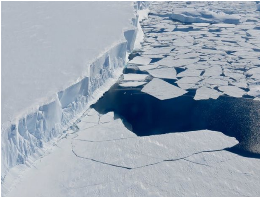
The fate of the West Antarctic Ice Sheet lies with the Thwaites Glacier. If the front of the Thwaites breaks up, it would expose an even larger body of ice to warm waters. (Karen Alley)

How the IPCC communicates this scientific debate will impact how coastal communities plan for sea-level rise . Low-lying cities, like Lagos, Nigeria , could become uninhabitable by the end of the century due to sea-level rise, especially if the higher model estimates prove most prescient.