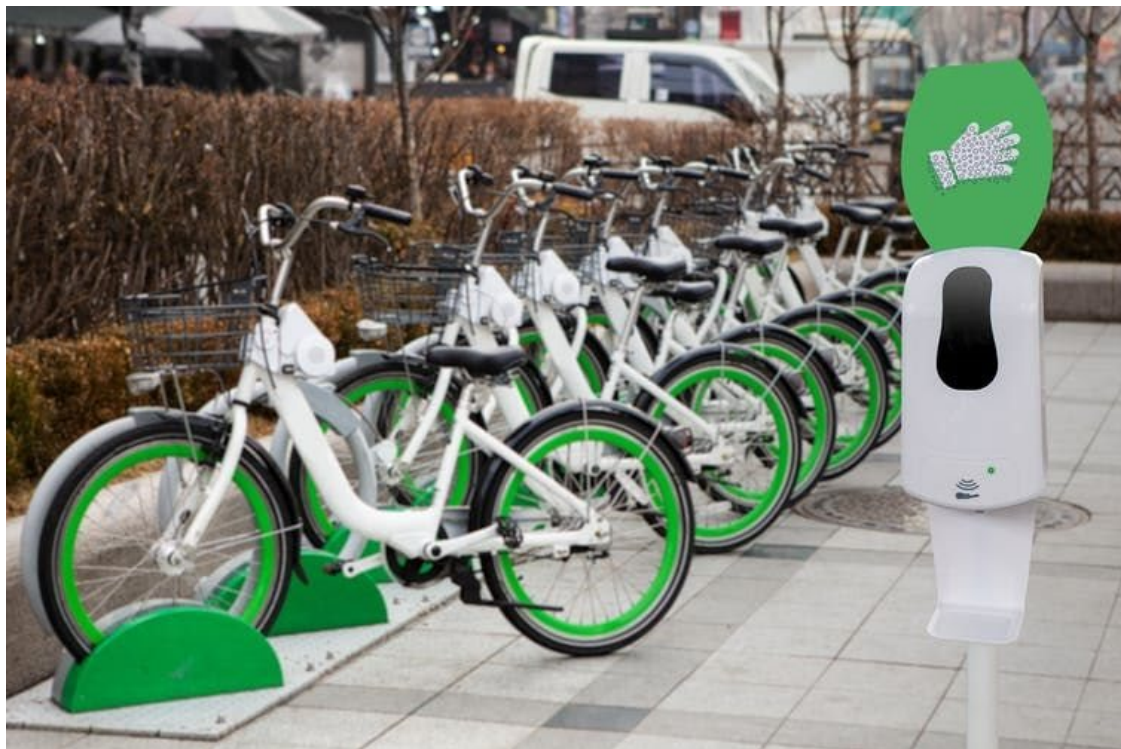
Bike-share operators have had to respond to public concerns about being COVID-safe.

Some programmes have actually adapted to the shift from public transport to bike sharing by offering essential workers and healthcare workers free or discounted memberships. In New York, as subway use has dropped, the city has constructed bike-share stations near hospitals .