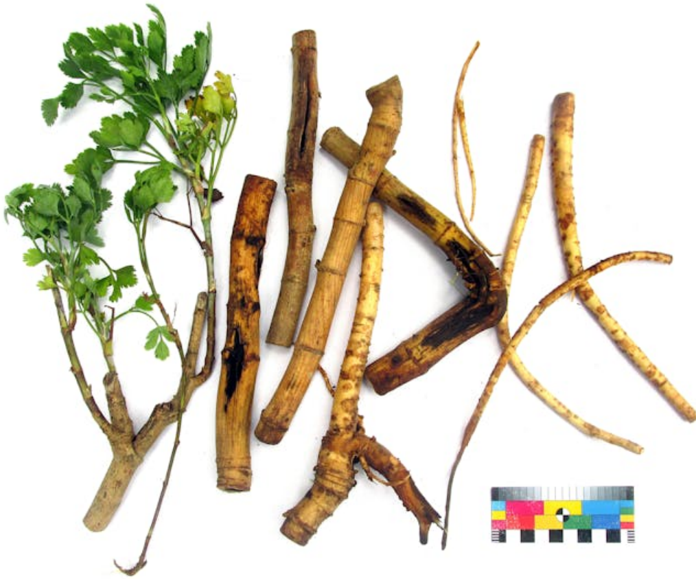
Mberwotel root, stem and leaves.

From this information it is reasonable to infer that controlled fermentation arose on the African continent alongside bow hunting and the use of poison tipped arrows, some time between 60,000 and 24,000 years ago.