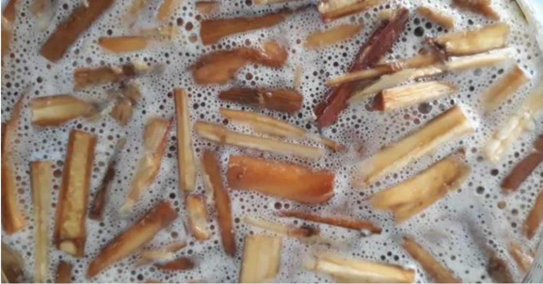
Honey-alcohol fermentation experiment with chopped "moerwortel" plant additive, Glia proliferata . Neil Rusch

Alcohol is the most widely used psychoactive substance in the world. But where was the first alcoholic beverage brewed and consumed?