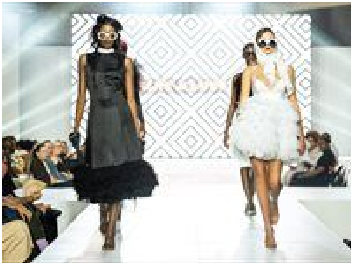
Over 1,000 people attended the longstanding two-part event at Johannesburg's Mall of Africa, the country's fashion capital. Mac and Graftobian sponsored the runway looks, and AfriMax broadcast the show via DSTV with Shudufhadzo Musia as the host.