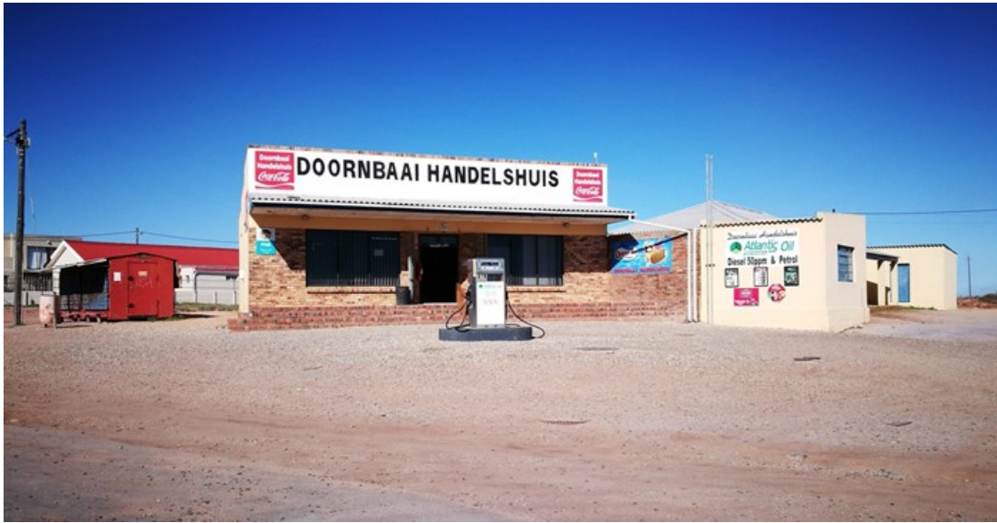
Note the (one and only) petrol pump...