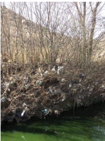
Plastic bag litter along the Jukskei River,

One attractive strategy is pursuing a legally binding phase-out of most single-use plastics at the global level. I believe this approach makes sense because it would build on current national and municipal efforts to eliminate single-use packaging, and would create opportunities for new small and medium-sized businesses to develop more benign substitutes.